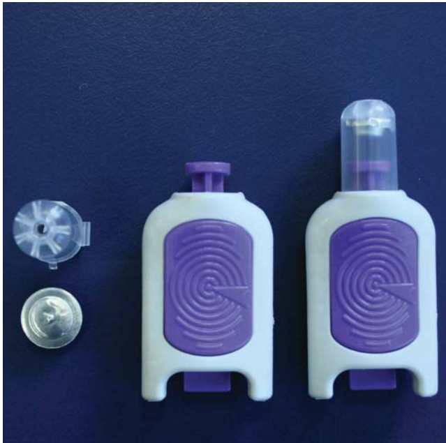
VersiDoser delivery device with blister

production line; the sealed blisters containing the drug formulation are then separated and loaded into an injection molded, single-use, disposable delivery device (see photo above). The product remains sterile until dispensed and comes into primary contact with only the laminate and the micropump, both of which are composed of USP class materials.