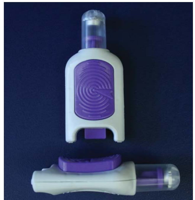
Device with actuator platform raised